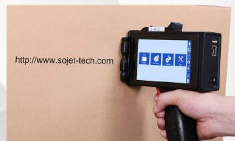
Different views of Dragon I printer